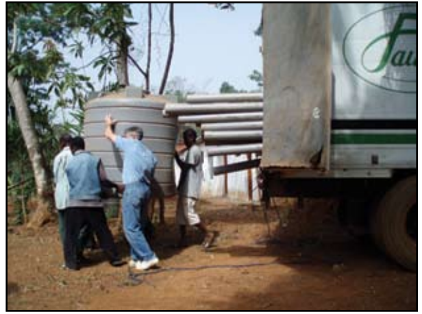
Del getting ready to set up water tank under eaves of roof to catch rain water

Now, as I look out my bedroom window, even though the room is bare, I can hear the carpenters hammering, I can walk outside and see Delbert up on the roof trying to put rain gutters on, and Jack down in a ditch digging to replace the sewage line. They are all preparing for the coming of the FIRST TEAM . Our son, Palmer, is bringing 15 men from the church he pastors in Chandler, Arizona (the GROVE BIBLE CHURCH ), to complete the first house.