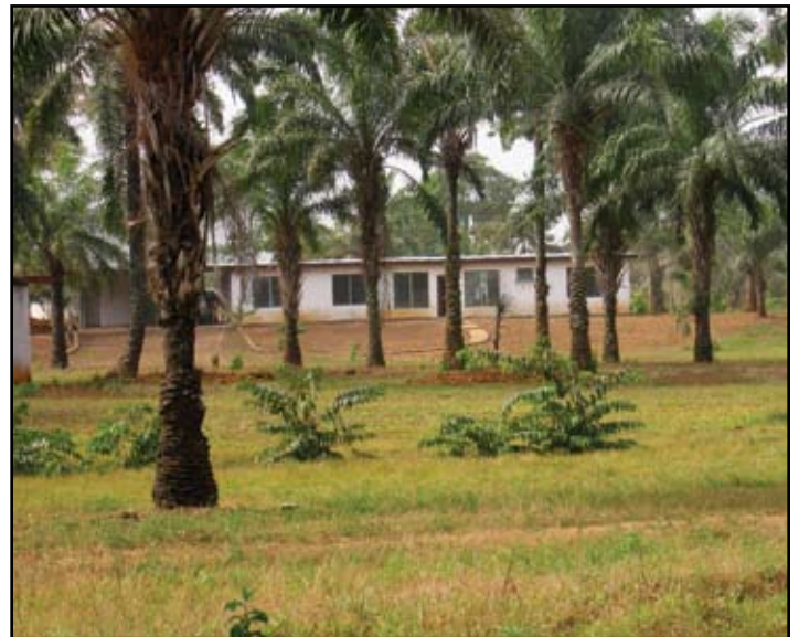
Palm Trees Out My Window

As I look out my bedroom window here on the ABC campus in Liberia, I see the towering palm trees lining the driveway and the bare steel girders of the beautiful chapel begging to have that bareness covered, the gaping windows filled with colorful glass panes, the mildewed walls adorned in white paint.