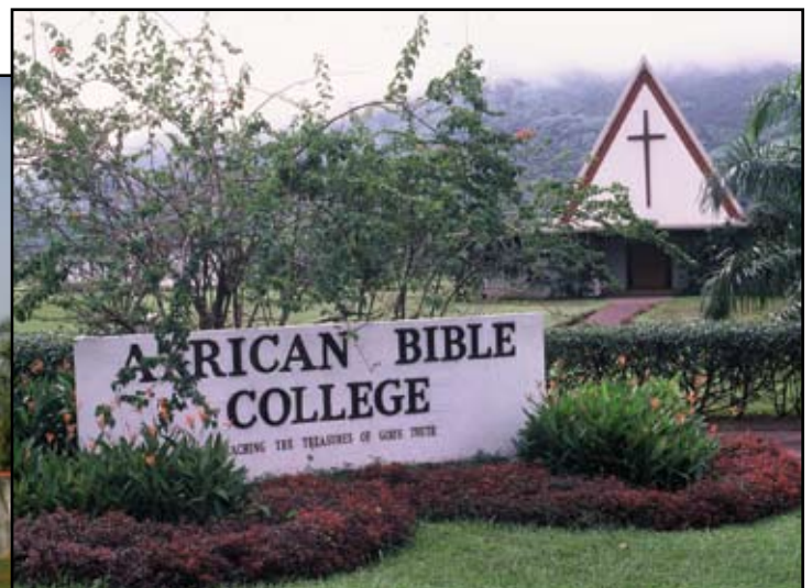
After Restoration— By Faith